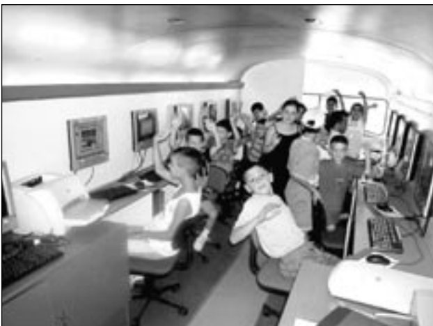
Children from rural Lebanon learn to use computers and research the internet aboard the Smart Bus, a collaborative effort of USAID, Mercy Corps, and Microsoft.