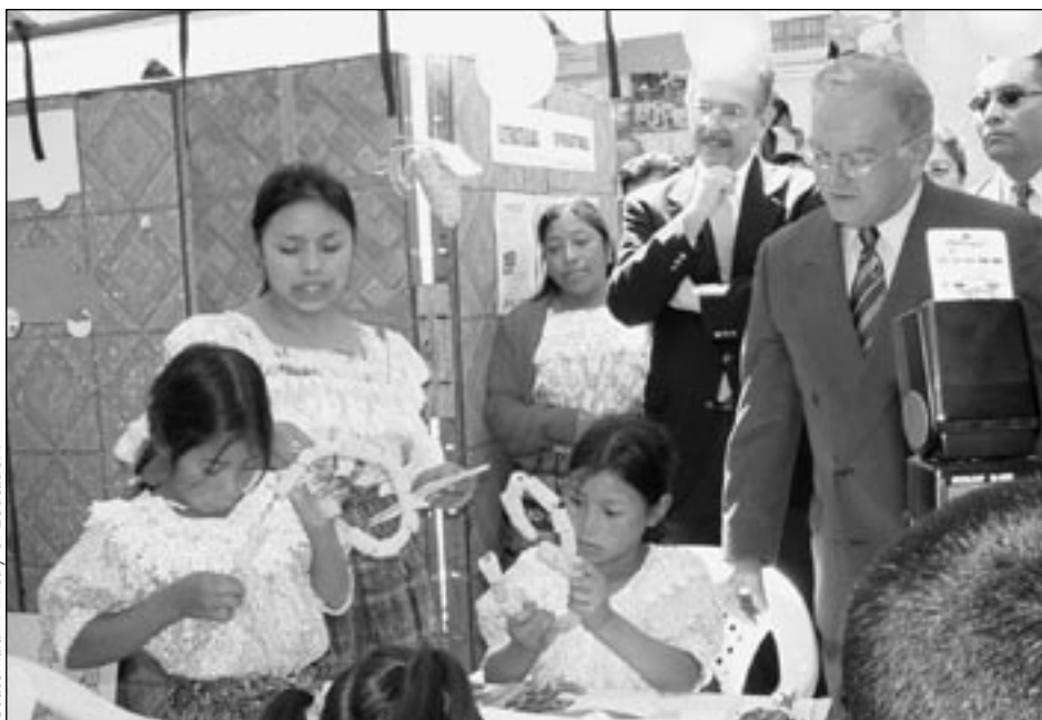
At a USAID-World Learning event in Guatemala, a bilingual (K'iche'-Spanish) teacher explains to Guatemala's vice president and USAID/Guatemala's mission director the methods of teaching she learned through the Access to Intercultural Bilingual Education Project (PAEBI). The USAID/PAEBI program focuses on teacher training, materials development, community participation, women's leadership, and improved educational policies to strengthen educational quality, cultural pluralism, and gender equity and equality.

Institutional reform ranges from efforts to counter problems with financial corruption and teacher absenteeism to fostering decentralized school governance. 2 Reforms supported by USAID include